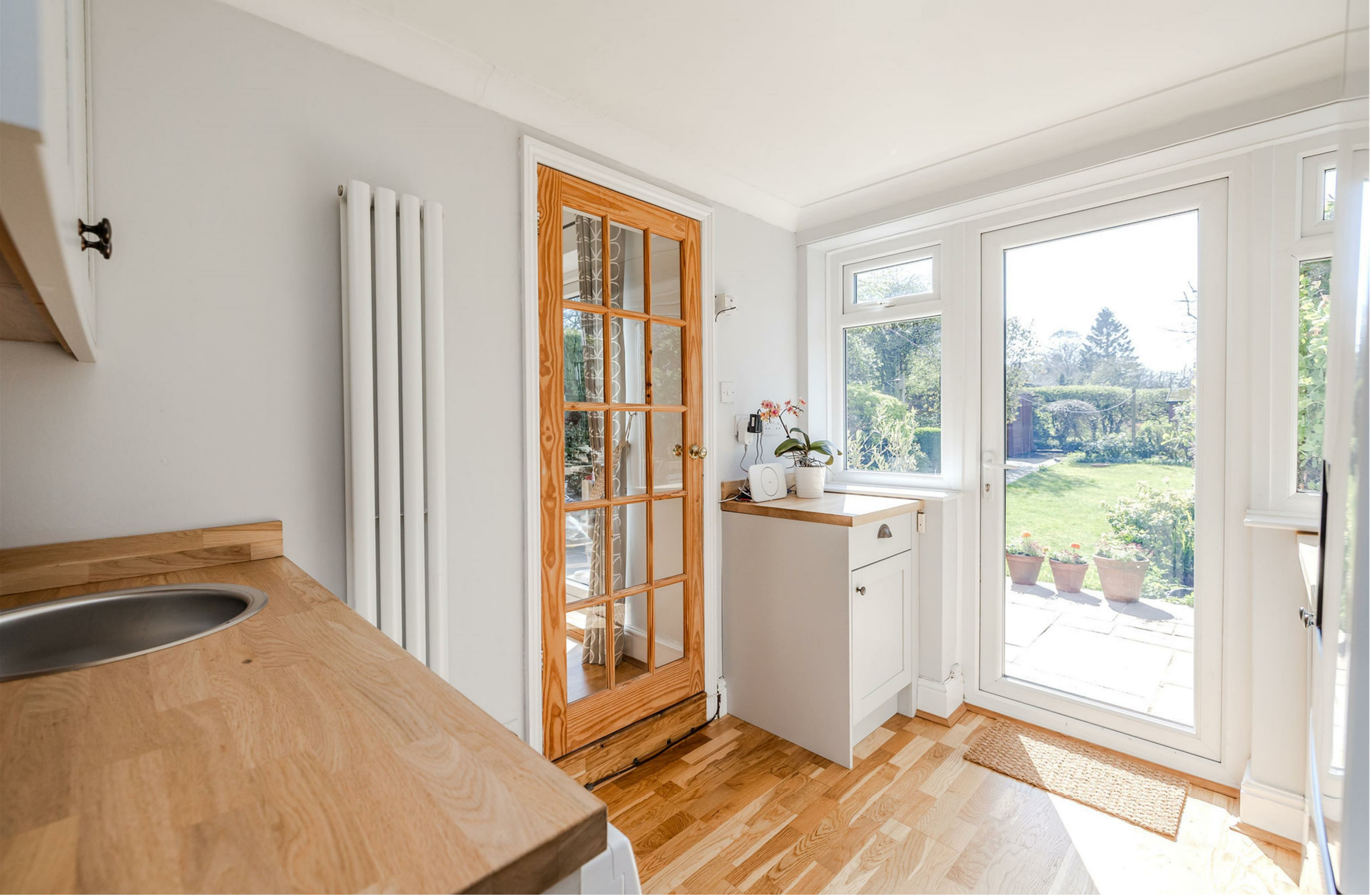
18 Coronation Road, North Walbottle, Newcastle Upon Tyne, NE5 1PU